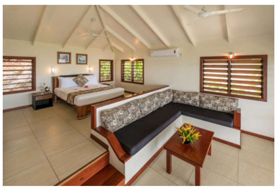
Premium Ocean View Villa

Dive boats return in time for lunch, leaving hours free for family time and a little exploring topside. Adventurous kids are well catered for here, though there is no organised kid's clubs or child minding on offer. It's all about getting out in the great outdoors with activities like swimming (in the pool or off the beach), fishing and paddling.